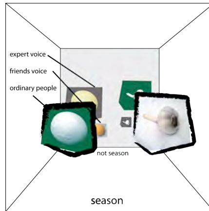
Figure 5. The temporal season space where fruits and vegetables move outwards or inwards depending upon season