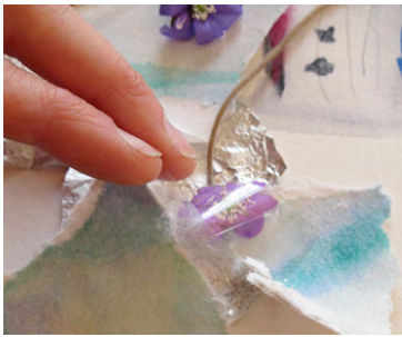
Figure 3. Working embodied to get an embodied expression

The central view in the application is the season's view [fig.1] where the user can see the three different voices represented. To express a notion of a room where groceries are grown, rather than a linear timeline showing seasons tied to a year, we have chosen to build the fruits and vegetables stories as a zigzag in time [fig.4] [3]: The fruits and vegetables are each moving inwards- and outwards in a space where the bottom is out of season and the top is in season. To move between different points in time the user scrolls on the fruits' background as if turning a round table and the fruits and vegetables will appear/disappear fluently.