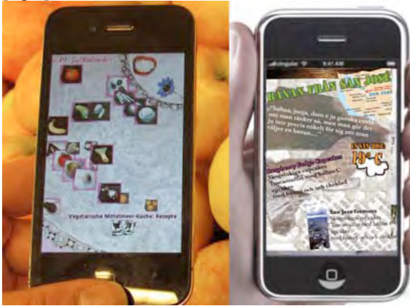
Figure 2. Product related information brought by an angel (left), as a collage (right)

we decided to balance qualities of surprise, playfulness and provocation together with the feeling of embodiment to assemble the concept of the application. We carefully sculptured the forms and interactions of the different information sources and we also cared about having an embodied process, where we playfully collected material in real nature to build a library of elements and expressions. [fig.3]