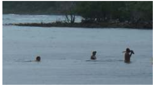
Figure 5 : Group of people walking from across from one island to the other

Being on water is not the only way that harm can come to the mobile phones. Being in the water was equally an everyday mundane activity in Rah and other parts of Vanuatu, as you can see in Figure 5. Fishing was often done by plunging all the way inside the water, sometimes in the evening, with the help of battery operated, waterproof, flashlights, sometimes during daytime, depending on the kind of catch they were aiming for.