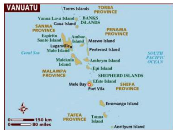
Figure 1 : Map of Vanuatu

The whole of the research project was conducted during 2 months in the country of Vanuatu. In particular, the results presented in this report, focused on The Banks islands, in Vanuatu a northern group of Islands part of the Torba province (see Figure 1). The choice of site was based on locally obtained information where we looked for a place where mobile telephony was just becoming a reality.