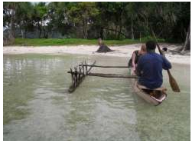
Figure 3 : Dugout canoe

Being on water is an everyday mundane activity for people in Rah and Motalava. Crossing back and forth between the two islands, for instance, is very common. From children going to school and back twice a day (because of lunch time), men and women going to meet family members, to buy and sell something or to take care of any other business, this is a basic activity, especially for inhabitants in Rah, given the reduced demographical and geographical dimension of their island and the presence of the airport in Motalava. Most of the crossing between the two islands was made using a dugout canoe, which was locally known as a “Taxi”. The canoes mentioned, or “Taxis”, are built from a single tree trunk, and for reasons of stability, most of them were balanced using a lateral log, tied to the main one with the help of auxiliary logs and rope (Figure 3). We will now look at some encounters between the mobile phone and these practices.